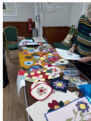
Members having fun with Four corners!

Also it is the time for subscriptions so please bring your cheque book. Subscriptions will remain unchanged at £38.